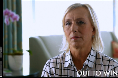
OUT TO WIN