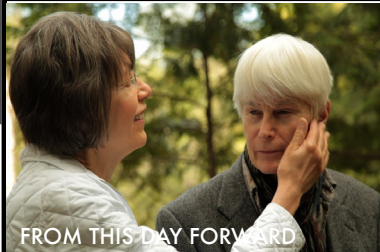
FROM THIS DAY FORWARD